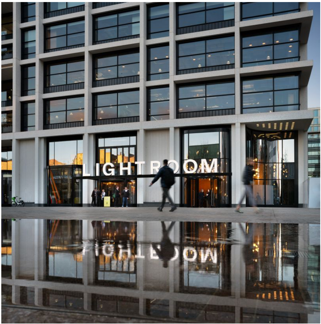
Lightroom exterior, Haworth Tompkins

Around 50 minutes long, the looped screening touches upon key drivers and projects of his long career over an ever-changing layout. Up to 380 viewers in the audience are sprawled on the floor, leaning against walls and sitting on occasional benches or in one corner, tiered seating. The seamless digital projections cover all four walls and often the floor. Sometimes the effect is immersive, all five surfaces within a single image or animation – in quieter moments, the opposing walls may display the same picture. At one point, there is a