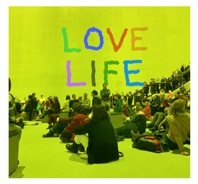
David Hockney: Bigger & Closer (not smaller and further away) installation at Lightroom