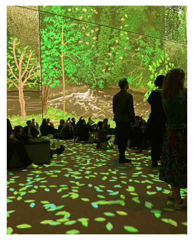
David Hockney: Bigger & Closer (not smaller and further away) installation at Lightroom