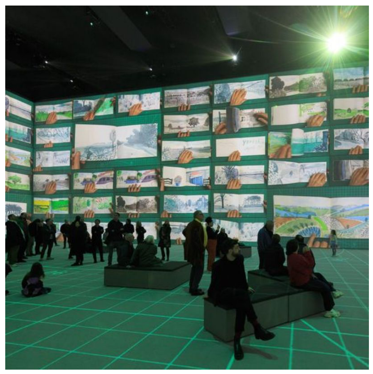
David Hockney: Bigger & Closer (not smaller & further away)

This is a sensitive and insightful new look at a contemporary master. He has always embraced new technologies, and here at Lightroom, a space has been created that celebrates decades of creativity as well as cutting-edge presentation.