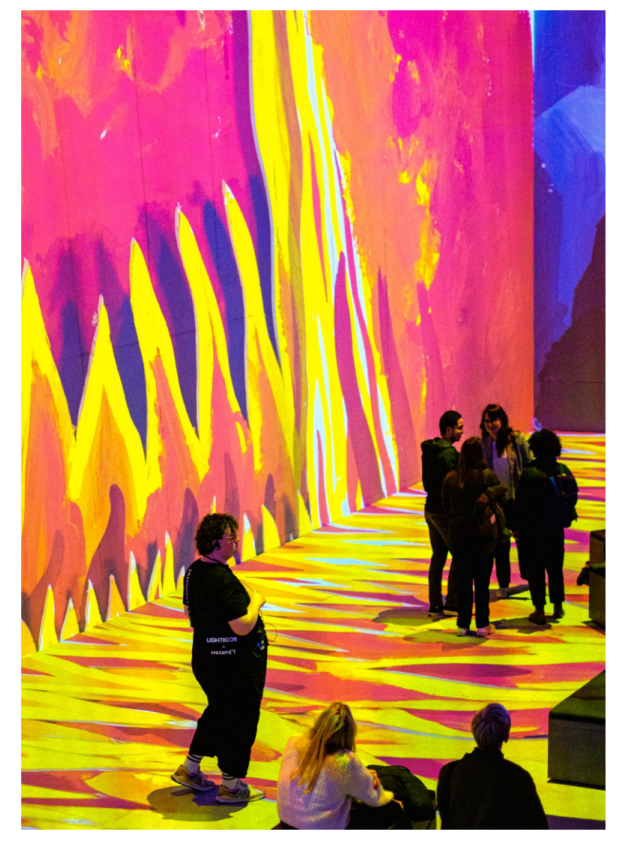
David Hockney: Bigger & Closer (not smaller and further away) installation at Lightroom

Many of his most famous works are shown in passing. Still, in the collaborative sequences, the new space shines brightest, and the artist's misgivings on working with people ("Collaboration means compromise") are proven wrong. In a series of Polaroid photo montages, the finished works are shown 'developing' as if the Polaroids have just been taken. In another element, the sun rises, and a single bird flies across the evolving fields.