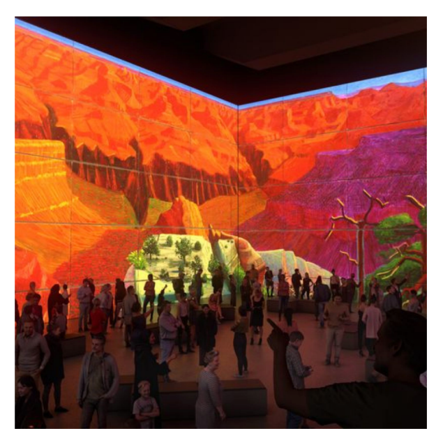
Installation of David Hockney's "A Bigger Grand Canyon" 1998 Oil on 60 canvases , 81 1/2 × 293" overall, © David Hockney Collection National Gallery of Australia, Canberra