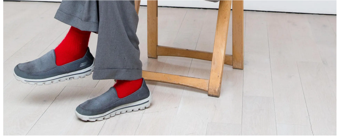
David Hockney at Annely Juda Fine Art in 2015 on the occasion of his solo exhibition there, Painting and Photography .