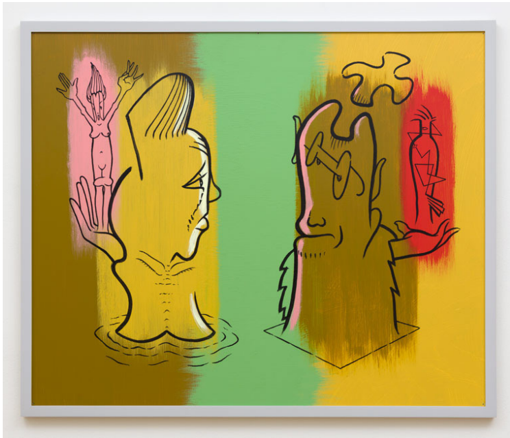
Matron and Mage

Talk to the Hand, (2018), presents a Guston-esque triangular shaped male head face to face with a more rounded head held in a disembodied hand as if a piece of fruit. A transparent pink wash covers the canvas, bisected by light aqua and purple stripes. The black outlined figures are positioned within these stripes. What transpires between them can only be inferred.