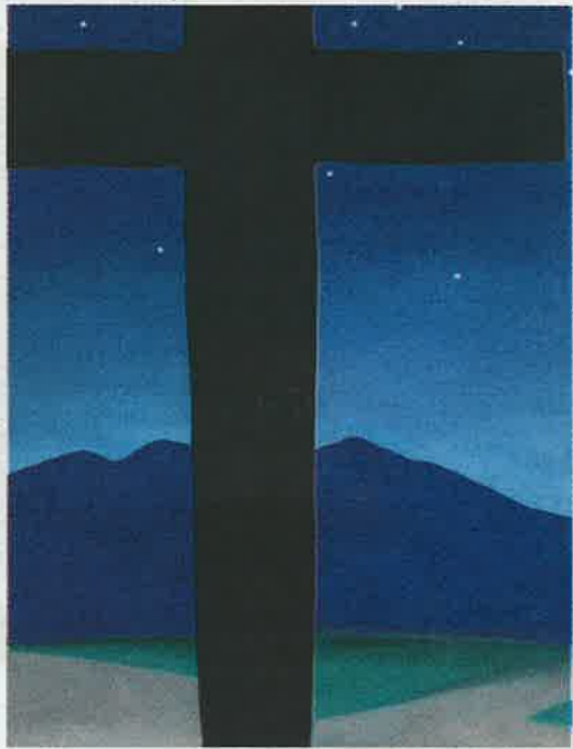
Georgia O'Keeffe, Black Cross with Stars and Blue , 1929. Oil on canvas, 40 x 30 inches. Private Collection.

THIS BEAUTIFUL EXHIBITION tells the little-known story of how the New Mexico landscape, and O'Keeffe's introduction to Hispanic and Indigenous art and architecture, inspired a significant creative shift in her painting. In addition to O'Keeffe's iconic landscapes, it includes newly discovered paintings, and the work of Hopi artists Ramona Sakiestewa and Dan Namingha.