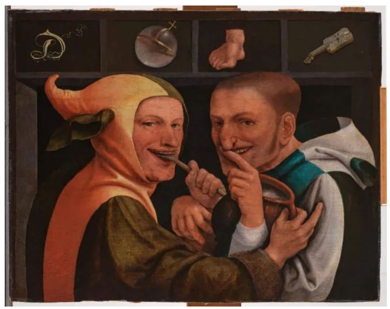
Jan Massiis, "Rebus- The World Feeds Many Fools," about 1530. Dallas Museum of Art