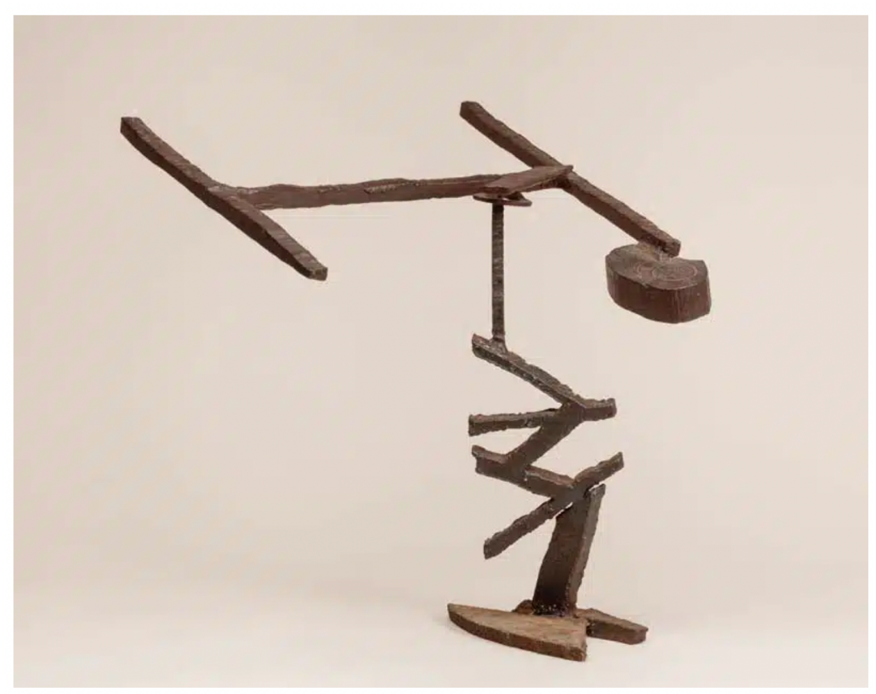
Mark di Suvero, "Mantus," 2001 Stainless steel, titanium, 7 x 17 x 14 in., Nasher Sculpture Center