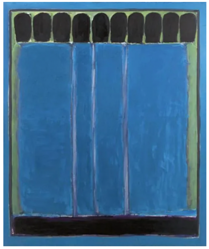
José Guerrero(Spanish, 1914–1991), Intervalos azules, 1971. Oil on canvas, 72 1/4 x 60 1/4 in.(183,5 x 153 cm). Museo de arte abstracto español, Cuenca. Fundación Juan March, Madrid.