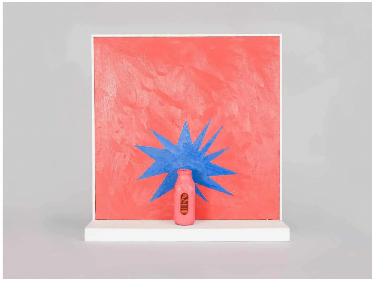
Joe Goode, Untitled, ca. 1962. Oil paint on canvas, wood, and glass milk bottle, The Menil Collection, Houston, Gift of Caroline Huber and the estate of Walter Hopps. © Joe Goode.