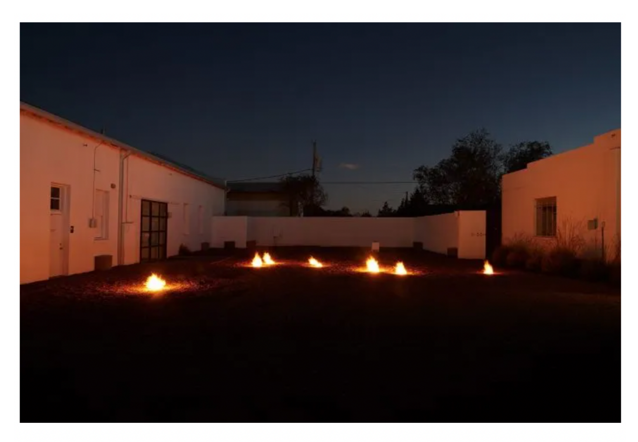
Nancy Holt, "Star Fire, "1986, from "Ecstatic Land" at Ballroom Marfa. Courtesy of Ballroom Marfa and Holt/Smithson Foundation.