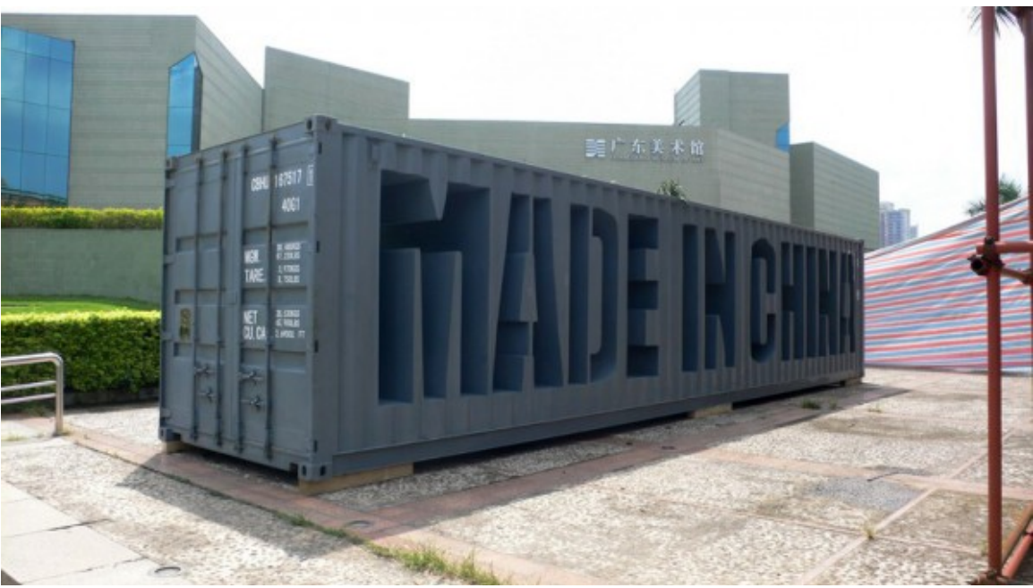
Made in China 02, 2011; Steel container,1200x270x240cm