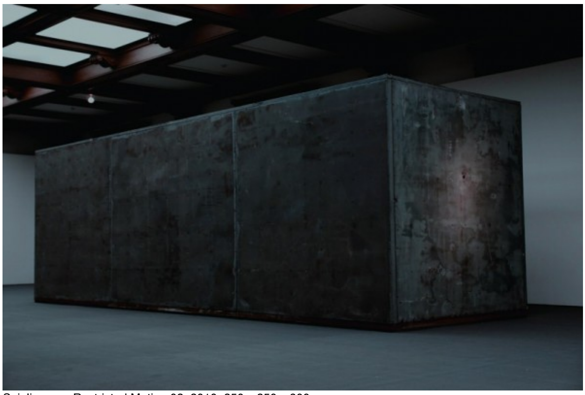
Sui Jianguo- Restricted Motion 02, 2010; 250 x 250 x 800cm

structure with a total weight of 8 tons and is a 2.5 meters high, 2.5 meters wide and 15 meters long sealed box with a wall thickness of 5 mm and an iron ball 2 meters in diameter. The entire space occupies a considerable proportion of a metal cargo container and from the iron ball the audience can hear the continuous constant rattle from the associated power device drivers, and every 27 seconds or so, there are deafening percussive noises in the metal cargo containers. From within the structure escapes the crashing sound of steel-on-steel collisions that send reverberations through the floor. When looking through one of the two viewing ports in the structure, the viewers catch fleeting glimpses of the huge steel ball rolling about within.