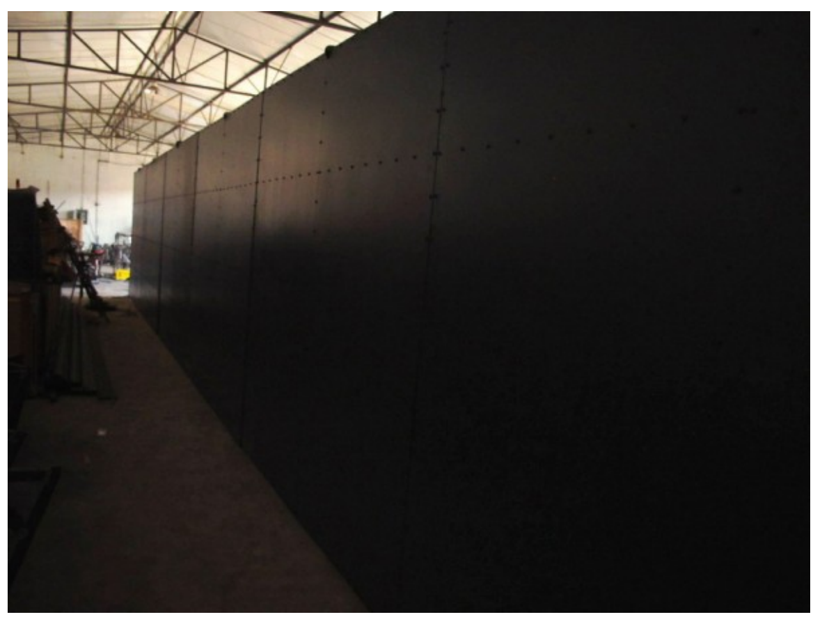
Sui Jianguo- Restricted Motion, 2010; 250 x 250 x 800cm