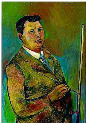
Single-minded... Self-portrait at Easel, 1960-61.

Fred Williams: Infinite Horizons opens at the National Gallery of Australia, Canberra, on Friday.