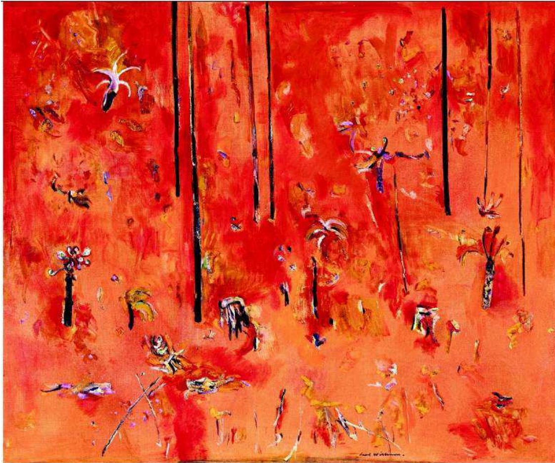
Minimalist abstracts ... Williams's My Garden , 1965-67; below, Lightning Storm, Waratah Bay , 1971-72. © Estate of Fred Williams