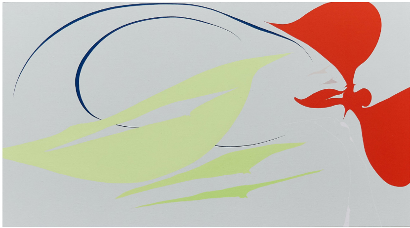
Gazer , 2020, oil on linen 30 x 54 ¾ in. (76.2 x 139.1 cm)

Other works seem pregnant with color, full and brimming with pure pigment. Glider's rotund blue edges onto a surface of rich berry red, alive with organic abstractions in pinks and greens. Prolonged viewing reveals subtle variations of color and detail.