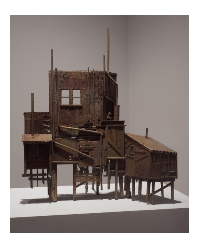
FURNACE COVE, 2010 unique cast bronze 24 1/2 x 21 x 15 in. (62.2 x 53.3 x 38.1 cm)

45 N Venice Blvd Venice CA 90291 info@lalouver.com 310 822 4955 lalouver.com/appointments