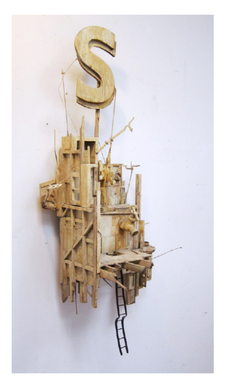
A THEORY OF SMOKE, 1997/2021 painted wood and metal construction 37 x 26 x 10 in. (94 x 66 x 25.4 cm)