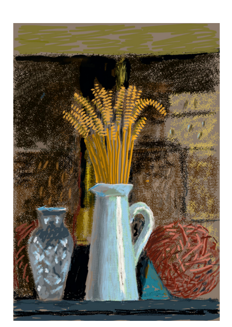
Glass Vase, Jug and Wheat, 2020 edition of 35, 35 x 25 in. © David Hockney

L.A. Louver 45 N Venice Blvd, Venice CA 90291 info@lalouver.com · 310 822 4955 lalouver.com