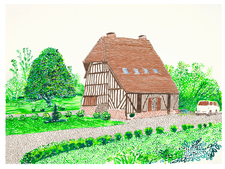
In Front of House Looking West, 2019, inkjet print on paper, edition of 35, sheet: 34 x 43 in., image: 29 x 39 in.

L.A. Louver is pleased to present David Hockney: My Normandy , an exhibition of sixteen recent prints from the internationally acclaimed artist, including eleven prints from original drawings, three iPad prints, and two 40-foot-long frieze prints. This will be Hockney's twenty-second solo exhibition with the gallery since 1978.