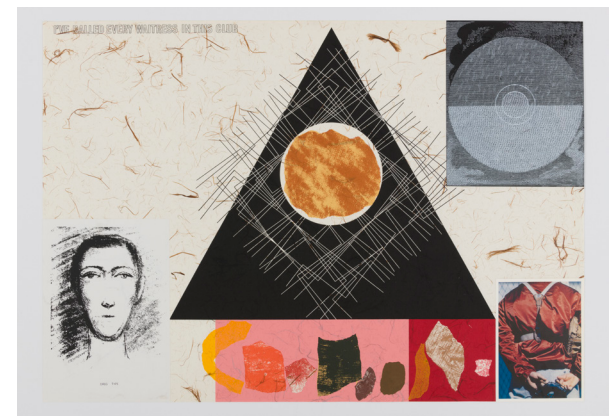
I've Balled Every Waitress in This Club, 1967 color screenprint, 22 7/8 x 32 5/8 in. (58.1 x 82.9 cm), Edition of 70

of an Old Jewish Painter: "I kept doing it because Chris was a magician and a wonderful guy and each collage egged me on..." Artist and master printmaker developed a very close collaborative relationship over this period, Kitaj trusting Prater's judgment implicity. Whether working close by in London, or thousands of miles apart when Kitaj lived in California, they maintained a constant dialogue, with a stream of communication by mail going back and forth between the two men: collages and letters of instruction from Kitaj, responses and proofs from Prater. Once Prater had finished using the collages in the printing process he returned them to Kitaj, and they remained in the studio until the artist's death in 2007.