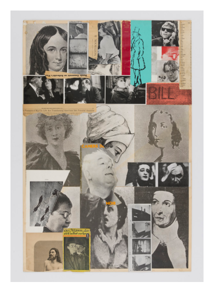
From the Lives of the Saints, 1975 collage on paper, 29 1/4 x 27 3/4 in. (74.3 x 70.5 cm)