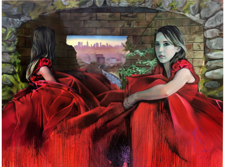
Rebecca Campbell, In Between , 2024, oil on canvas, 80 x 120 in. (203.2 x 304.8 cm), signed and dated verso