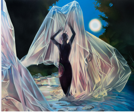
Rebecca Campbell Wolf Moon , 2024 oil on canvas 48 x 60 in. (121.9 x 152.4 cm) signed and dated verso