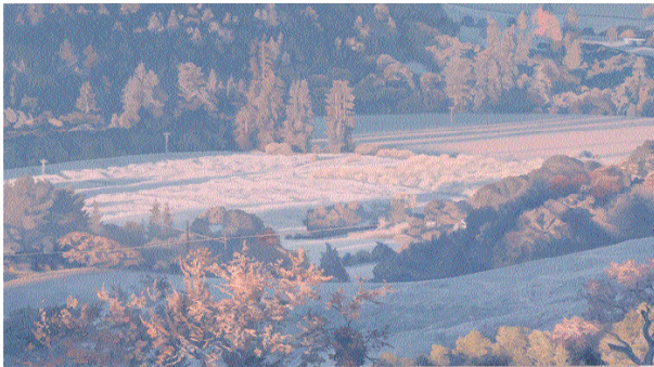
Sandra Mendelsohn Rubin, Valley View: Winter Frost , 2005, oil on polyester, 4 x 7 1/8 in. (10.2 x 18.1 cm)

Opening reception for the artist: Saturday, 6 January, 4:00-8:00 p.m