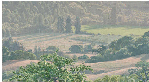
Sandra Mendelsohn Rubin, Valley View: Early Summer , 2005, oil on polyester, 4 x 7 1/8 in. (10.2 x 18.1 cm)

“More and more my work is about the joyful pleasure of painting”