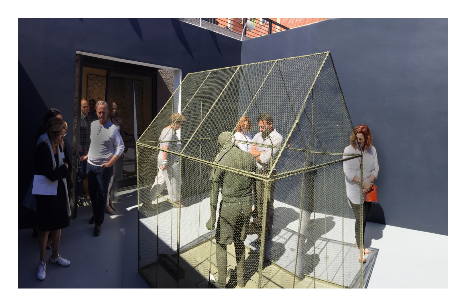
Enrique Martínez Celaya, "The Treasure of the Patient," 2015 Metal, wire, bronze, and 5 birds

Entering a small, dark gallery room with walls covered with mirrors, one sees a life-size bronze sculpture of the boy standing in a pool of water. You hear the sound of the boy's tears slowly hitting the water at his feet. Don't ask for whom the boy cries, he cries for thee. And, of course, it is impossible to ignore the live birds inside large cages; they tweet and chirp and, on occasion, unceremoniously leave drops of you-know-what while perched atop Enrique Martínez Celaya's bronze sculptures.