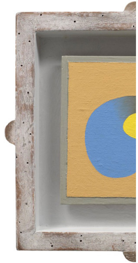
Frederick Hammersley, "Just so." Oil on linen. 10 1/4 × 10 1/4".

style and execution. "Landlord #2" (1972), for example, with its rectilinear black tuning fork touching the bottom edge of a white square, has a certain clarity and evenness that is not the case with the Russian's "Black Square" (1915). Whereas Malevich's painting reveals gravitas, Hammersley's painting emits a secular kind of transcendence. In other words, the cultural signifiers constitute part of each painter's reality. But finally, Hammersley brings in a new light through pure color and form. His sense of space inverts as if to remind us that time moves with us, not against us, depending on how we choose to see the world.