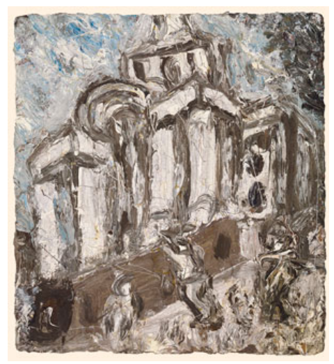
'Christ Church, Spitalfields, Spring' (1987)

Travelling by overground train to an early studio in Dalston, he began observing railways, which "always provide an interesting landscape, it's all about space and light". A rush of sensations is packed into converging lines in "Here Comes the Diesel" (the title from a grandson's scream; a railway line passes Kossoff's garden); shafts of sunshine illuminate gleaming rails in "Between Kilburn and Willesden, Spring Afternoon". Building sites too, "beautiful as well as dark", are "very exciting to see". In their processes of demolition, excavation, construction, their sense of disequilibrium, they parallel Kossoff's method of creation, anxiously accumulating then scraping away paint, criss-crossing networks of lines to make stormy drawings – "Demolition of YMCA Building, London", "Kings Cross Building Site Early Days" – as vividly textural as paintings.