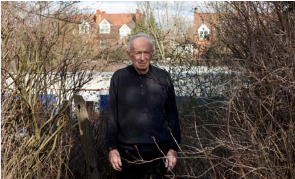
Portrait of the artist

He made drawing after drawing of the pinkish red-brick buildings (Britain's first housing estate, built in the 1890s) that surround the little park in the circus, with its bandstand at the centre. Summer trees jostle against a hot blue sky. In the distance, the tower of Hawksmoor's Christ Church, Spitalfields rises up with its customary effrontery – it is a building that he drew and painted repeatedly in the 1980s and 90s. The drawings of Arnold Circus are sunny, full of heat and light and even contentment. (Rather extraordinary for an artist of whom it was once written: " He provides so much unrestricted access to such massive amounts of spiritual discomfort that you marvel at its starkness. ") A cyclist whizzes through one drawing; a mother sits on a bench in another. The last one he made is inscribed "Saturday afternoon" in a shaky hand at its base, and he eyes it with tentative, and, he leads me to believe, wholly uncharacteristic satisfaction. Had you been wandering through Arnold Circus that afternoon during the Olympics it seems to me unlikely you would have noticed this slight, elderly, even Pooterish figure with his drawing board, in his bearing and manner the very definition of unassuming.