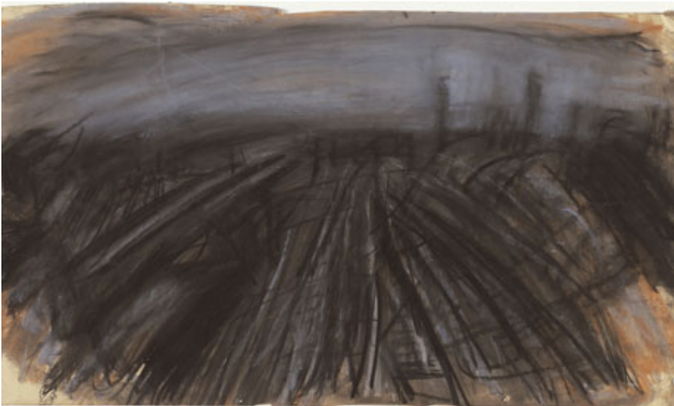
Extending lines ... a

The pattern of Kossoff's work has been to pursue, sometimes obsessively, a single subject over a period of years. On the mornings he did not have a sitter arriving in the studio, he would set off early to a chosen spot with his drawing board to work out of doors; then he would return to the studio to paint – a laborious process through which the final image would emerge only after many months of applying and then scraping away paint.