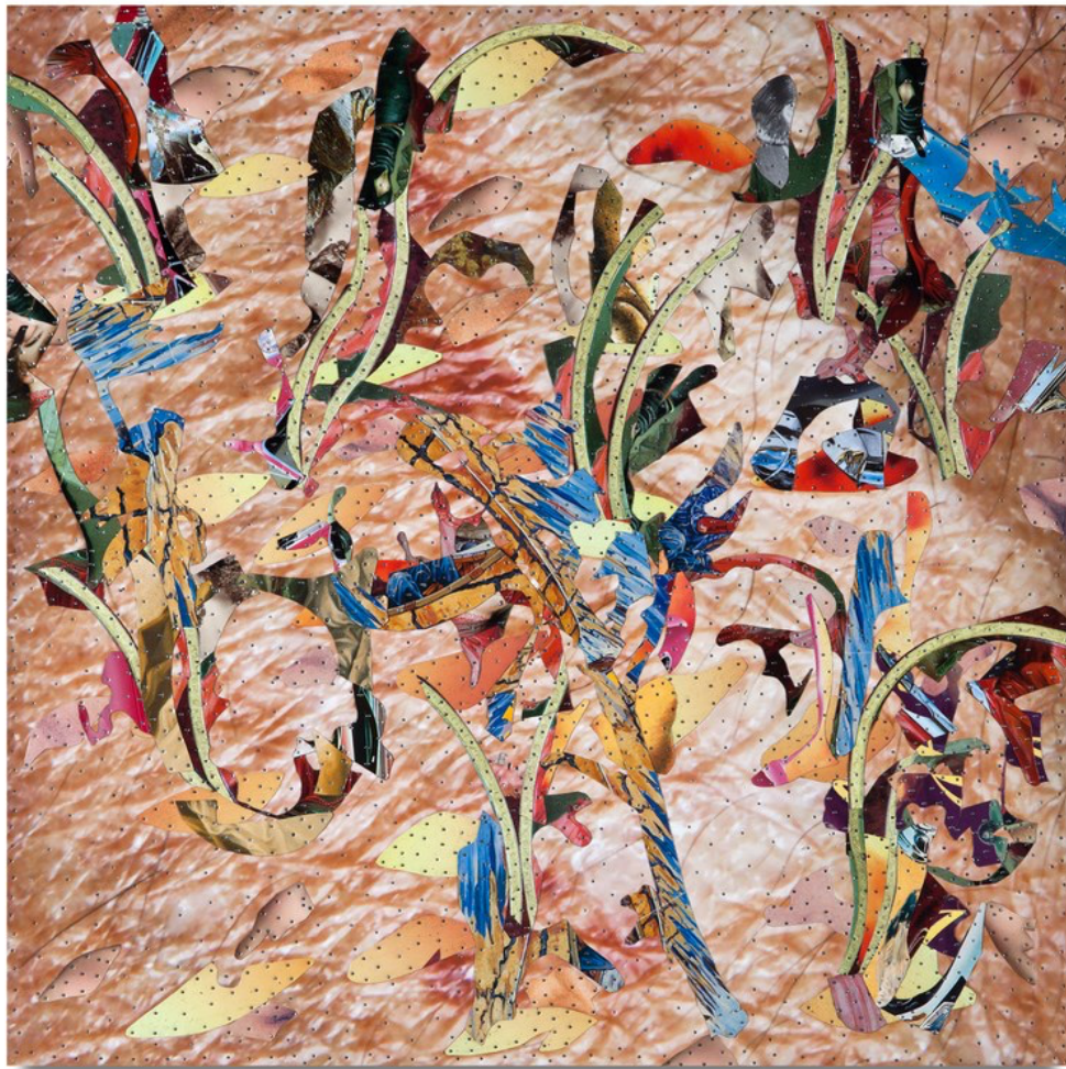
Tony Berlant, Wildcard , 2014, found and fabricated printed tin collaged on plywood with steel brads, 30 x 30 inches