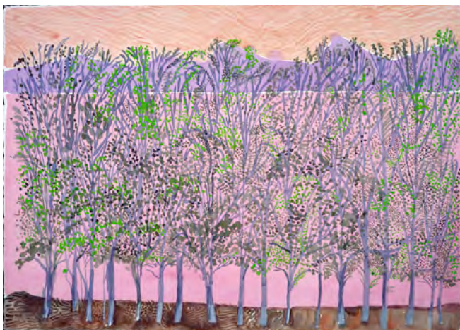
David Hockney, Midford Birches , 2003, watercolor on paper. Paper: 29 3/4 x 41 3/4 in. (75.6 x 106 cm), Framed: 33 3/4 x 45 1/4 in. (85.7 x 114.9 cm)