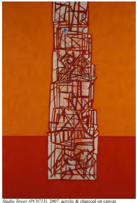
144 x 98 in. (365.8 x 248.9 cm)

Born in 1951, Bevan studied painting and sculpture at the Bradford School of Art. In 1971, he moved to London where he studied at Goldsmiths' College and the Slade School of Fine Art, and experimented with film, video and installation, as well as painting and sculpture. Since 1976, Bevan has exhibited widely, first in Europe; and beginning in the mid-1980s, in the United States, with his first solo U.S. show at L.A. Louver in 1989. Studio Tower (PC0713), 2007, acrylic & charcoal on canvas Significant one-man museum exhibitions include the ICA,