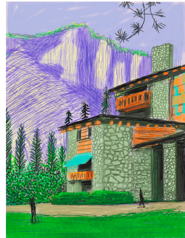
left to right: Untitled No. 8, Untitled No. 15, and Untitled No. 23, 2010, from The Yosemite Suite iPad drawing printed on paper, 37 x 28 in. (94 x 71.1 cm), Edition of 25 © David Hockney.

Venice, CA -- L.A. Louver is pleased to present an exhibition of iPad drawings by David Hockney. Titled The Yosemite Suite , the exhibition includes over two dozen new prints in which the celebrated British artist depicts one of America's most famous national parks.