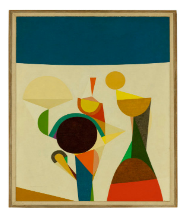
Frederick Hammersley, Growing game , #1 1958 oil on canvas, 42 7/8 x 33 in. (108.9 x 83.8 cm) framed

Hammersley's abstractions came out of drawing. While teaching at Jepson Art School in Los Angeles, he found "a delicious stone" to create intimate lithographic prints (each 3 x 3 inches) based on a grid structure of sixteen squares. He introduced compositional elements one by one, altering line, form, color, etc. to discover how each would react to the other. These small prints held the seeds for his later geometric paintings. After leaving Jepson in 1951, Hammersely recalled that he "bumped into hunch painting by accident," inspired by the shapes that he saw in the figure and in still-life, reducing them to elemental form. These were intuitively derived compositions that gained the attention of curator, Jules Langsner, who included Hammersley in the landmark 1959 exhibition, Four Abstract