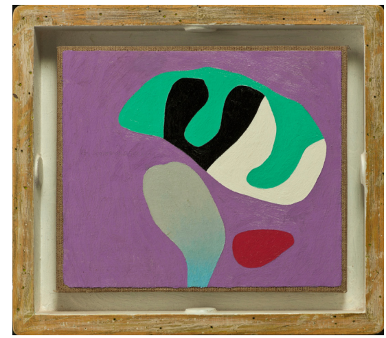
Frederick Hammersley, Steak and ale , #6 1989 oil on rag paper on linen on wood 11 1/4 x 12 3/4 in. (28.6 x 32.4 cm) framed

A new multi-media work that incorporates sculpture and film.