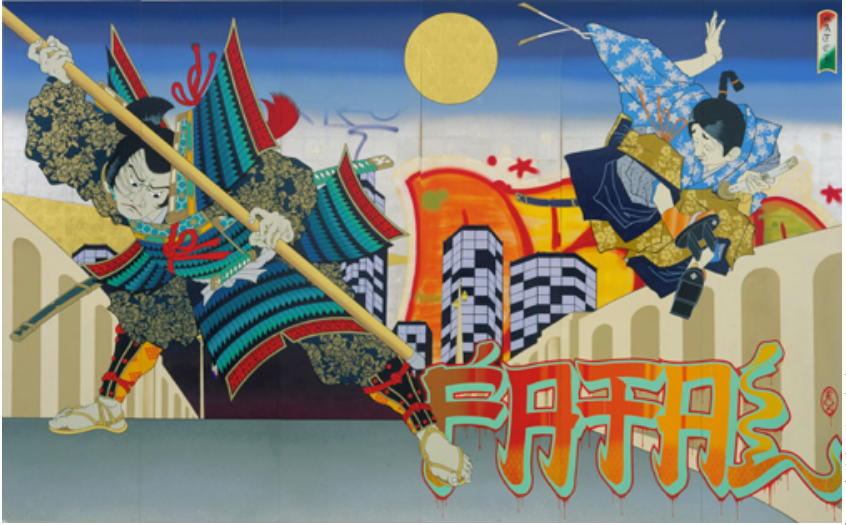
Fatal Match, 2006, gold & silver leaf, acrylic, paint marker, spray paint and Mean Streak on wood panel Six Panels Overall: 83 x 126 in. (210.8 x 320 cm)

cultural influences that range from the lush visuals of traditional Japanese tattoos, screen painting from the Edo period and woodblock prints by ukiyo-e artists, to contemporary Japanese cartoons and hip-hop culture.