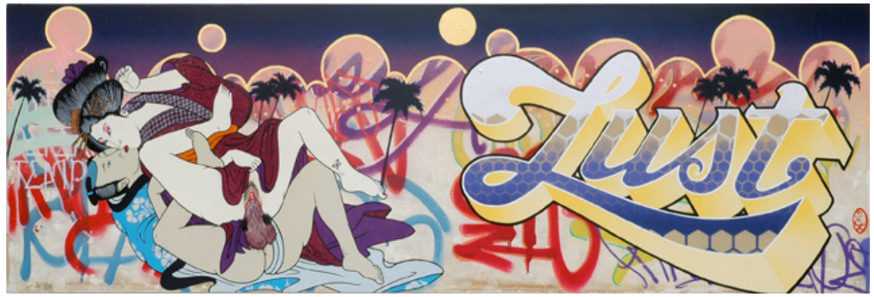
Lust, 2006, yellow and white gold leaf, spraypaint and Mean Streak on wood panel, 16 x 48 in. (40.6 x 121.9 cm)

L.A. Louver is open Tuesday through Saturday, 10:00 a.m. to 6:00 p.m. Validated parking is available in the garage directly opposite the gallery.