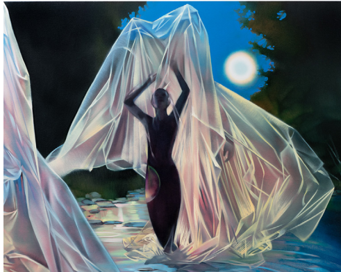
Rebecca Campbell Wolf Moon , 2024 oil on canvas 48 x 60 in. (121.9 x 152.4 cm) signed and dated verso