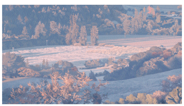
Sandra Mendelsohn Rubin, Valley View: Winter Frost, 2005, oil on polyester, 4 x 7 1/8 in. (10.2 x 18.1 cm)

6 January - 3 February, 2007 Opening reception for the artist: Saturday, 6 January, 4:00-8:00 p.m