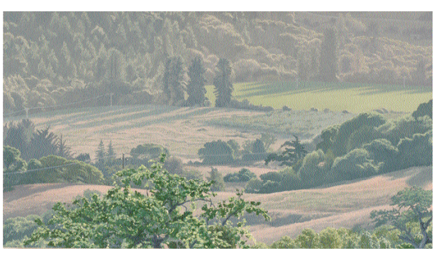
Sandra Mendelsohn Rubin, Valley View: Early Summer , 2005, oil on polyester, 4 x 7 1/8 in (10 2 x 18 1 cm)

"More and more my work is about the joyful pleasure of painting" —Sandra Mendelsohn Rubin