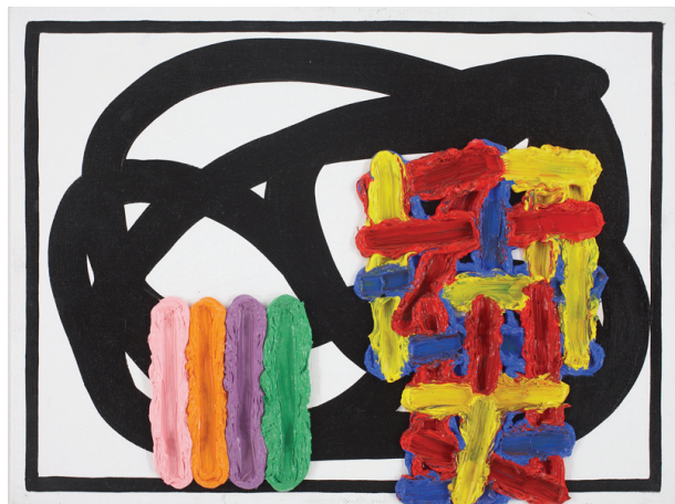
Jonathan Lasker Scene and Signs , 2009 oil on canvas board 12 x 16 in. (30.5 x 40.6 cm)

Lasker's paintings are included in many private and public collections including Albright-Knox Art Gallery, Buffalo, New York; The British Library, London, England; Corcoran Gallery of Art and Hirshhorn Gallery of Art, Washington, D.C.; Eli Broad Foundation and Los Angeles County Museum of Art, Los Angeles, California; Moderna Museet, Stockholm, Sweden; Museum Ludwig, Cologne, Germany; and Whitney Museum of American Art, New York.