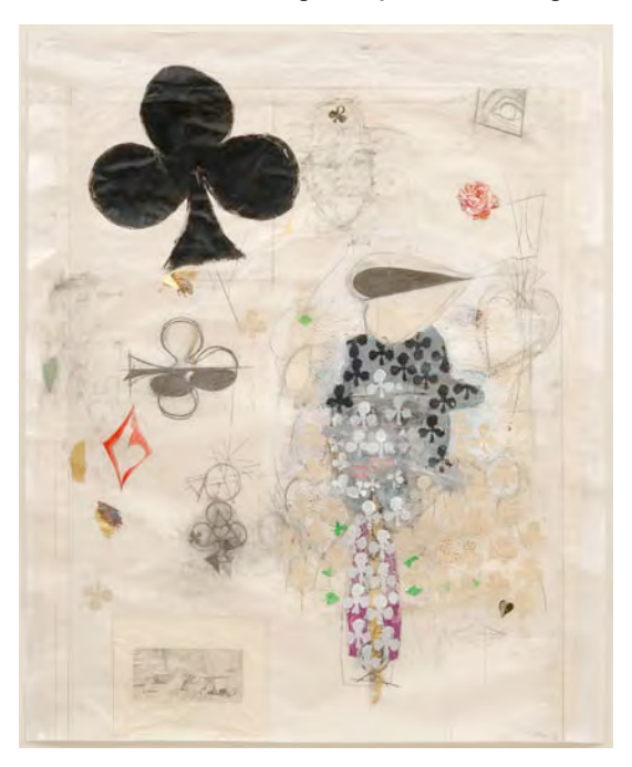
Tom Wudl, Legend , 2005, pencil, charcoal, acrylic, gold leaf and silver leaf on paper, 40 1/2 x 50 in. [102.9 x 127 cm]

This exhibition represents a significant departure in Wudl's art, with evidence of abstraction throughout the new work. Representational elements continue to be present, but are confined to the renderings of a limited number of icons. These icons include pips, eyes, flowers and the figures of Stan Laurel and Oliver Hardy – all of which are introduced to us in Legend , 2005. This work serves as a map to the characters in the exhibition. If Legend offers the viewer the possibilities of what she may encounter in this exhibition, then the large acrylic and collage on