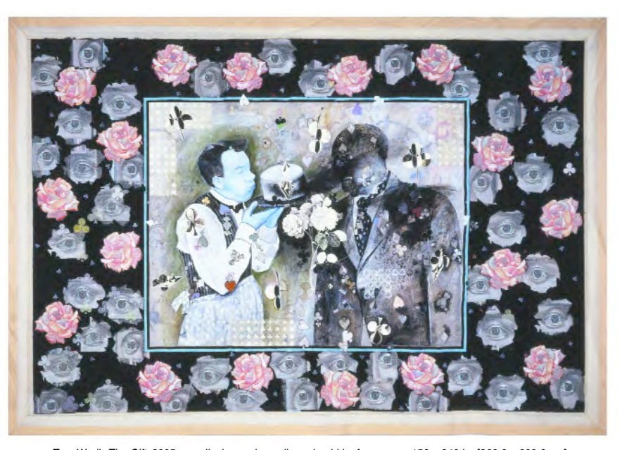
Tom Wudl, The Gift , 2005, pencil, charcoal, acrylic and gold leaf on paper, 156 x 240 in. [369.2 x 609.6 cm]

The focal piece of the exhibition is the monumental 13 x 20 feet mixed media paper collage The Gift, 2005. This work features at its center the figures of Laurel and Hardy. Whereas in previous paintings Wudl has addressed Laurel and Hardy's personification of the tragic-comic aspects of existence, in The Gift, 2005, this element is subsumed into the complex abstracted theatrical setting within which they are portrayed. The men's faces and bodies are almost obliterated, showered with flowers, abstract markings, and a multitude of pip forms (predominantly clubs and spades). Laurel and Hardy become innocent agents of transcendence to a realm larger than themselves and larger than the spectator. The complex theatrical curtain, which frames the two men, and is adorned with a myriad of eyes, roses, as well as the all-pervasive pips, represents this realm.