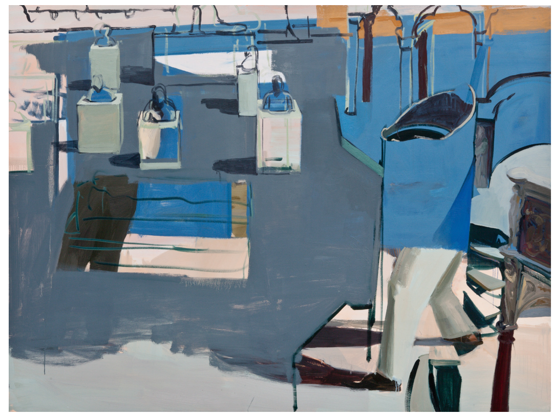
Sarah Awad | Courtyard, 2011, oil on canvas, 54" x 72".