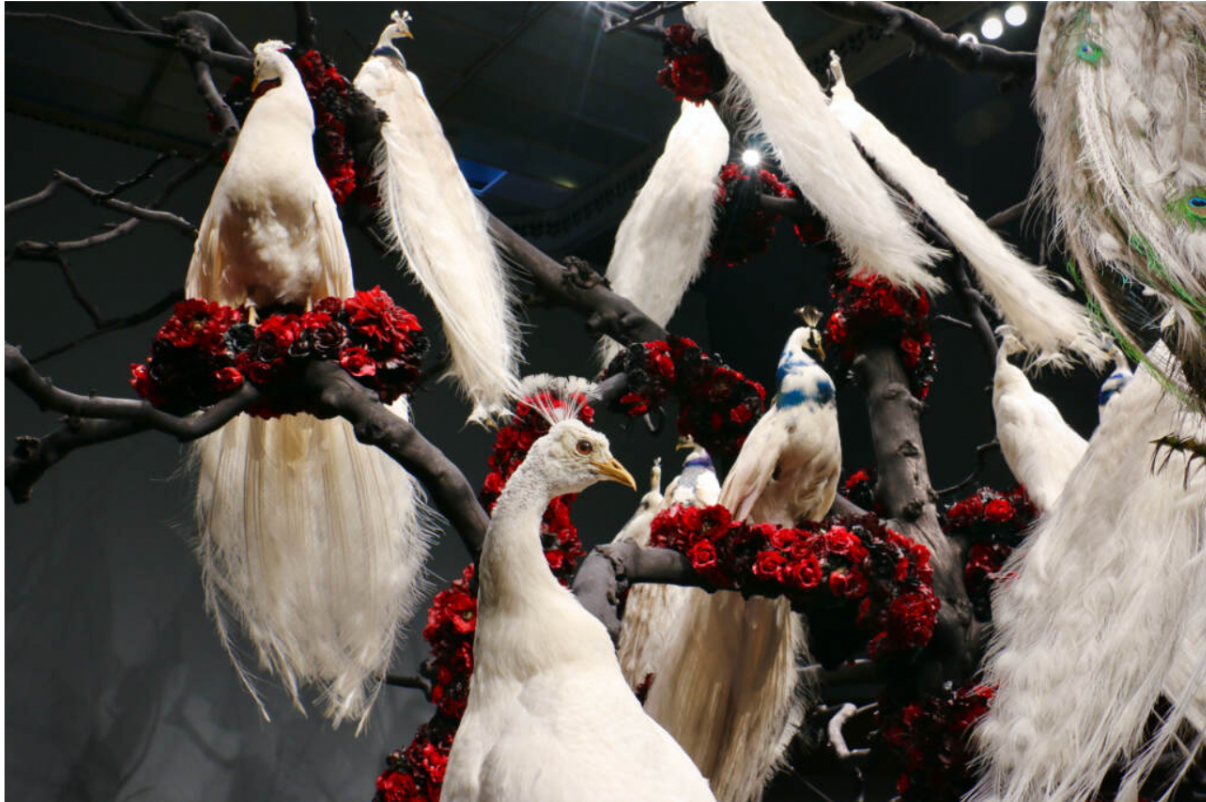
📷 A tree full of taxidermied white peacocks fills an exhibit room at the Pennsylvania Academy of Fine Arts. The untitled work by Petah Coyne was commissioned by PAFA for its collaborative exhibition with the African American Museum in Philadelphia.

climb a staircase built out of plywood, up to the skylight where one of the glass panes has been removed. Those who poke their head through the opening will see there is another second roof of skylights above the ceiling, the original skylight designed by Frank Furness, filling the attic space with light, i.e., the “rising sun.”