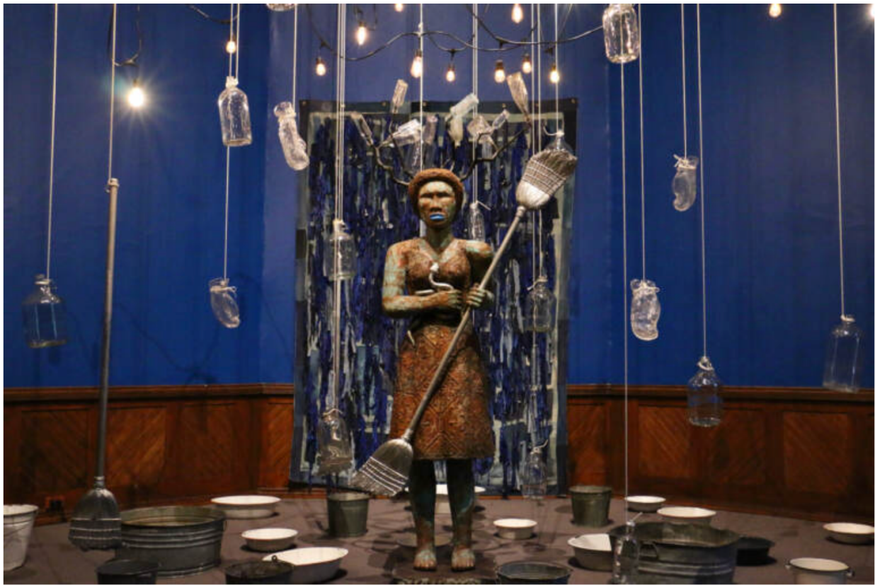
📷 Alison Saar's "Hygieia," at the Pennsylvania Academy of Fine Arts, features a figure of the Greek goddess of health and sanitation. The work is included in PAFA's collaborative exhibit with the African American Museum in Philadelphia, "Rising Sun: Artists in an Uncertain America."

By Peter Crimmins · Updated Mar. 24, 2023 1:01 pm