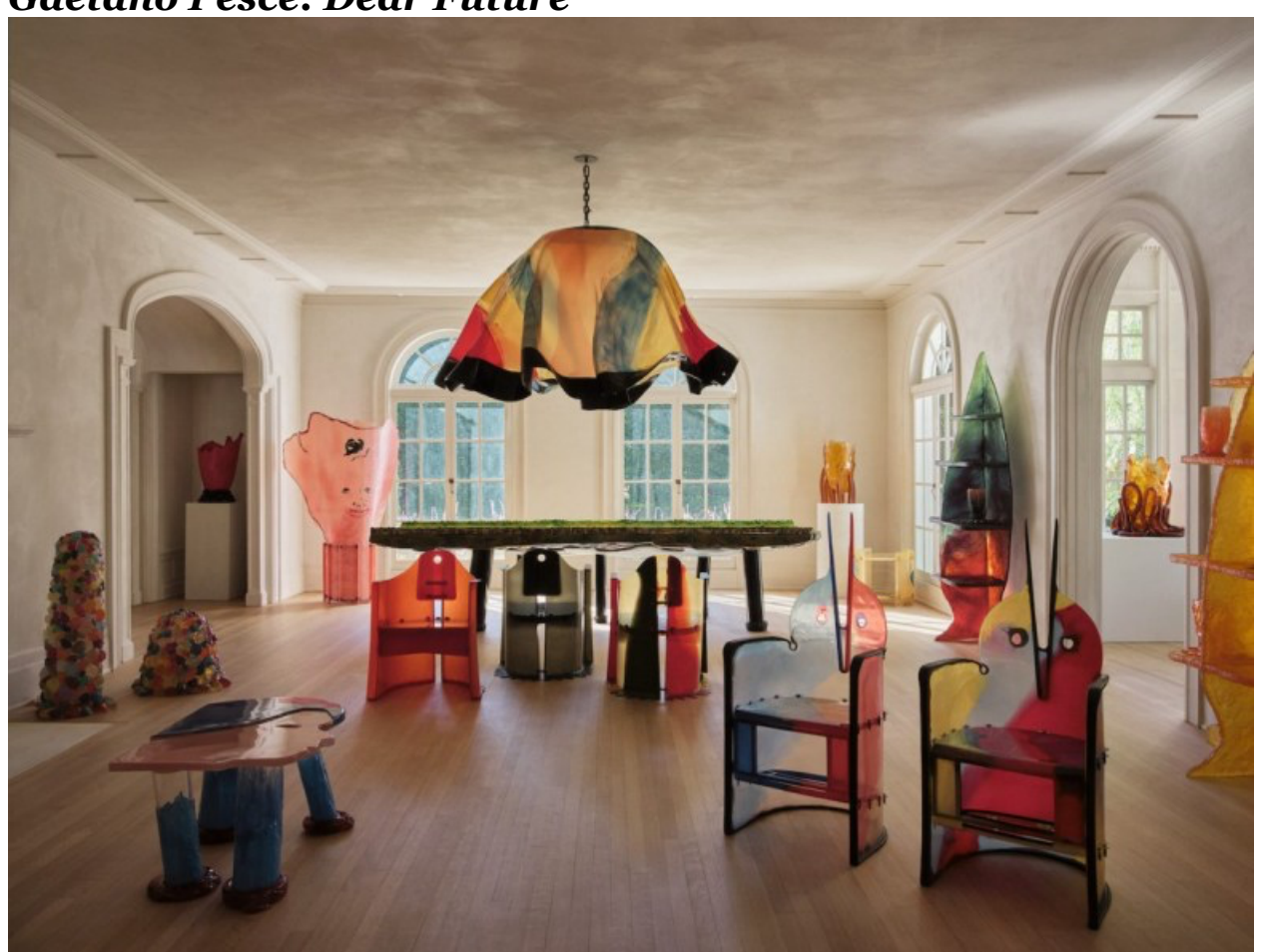
Installation view of Gaetano Pesce: Dear Future

Architect and designer Gaetano Pesce's work is characterized by bold colors, organic forms, experimental materials, and a whimsy that offers a vision of Modernism quite different from the understated, rectilinear uniformity of the International Style. He uses techniques like pouring colored urethane to thwart industrial standardization, giving near-identical objects their own