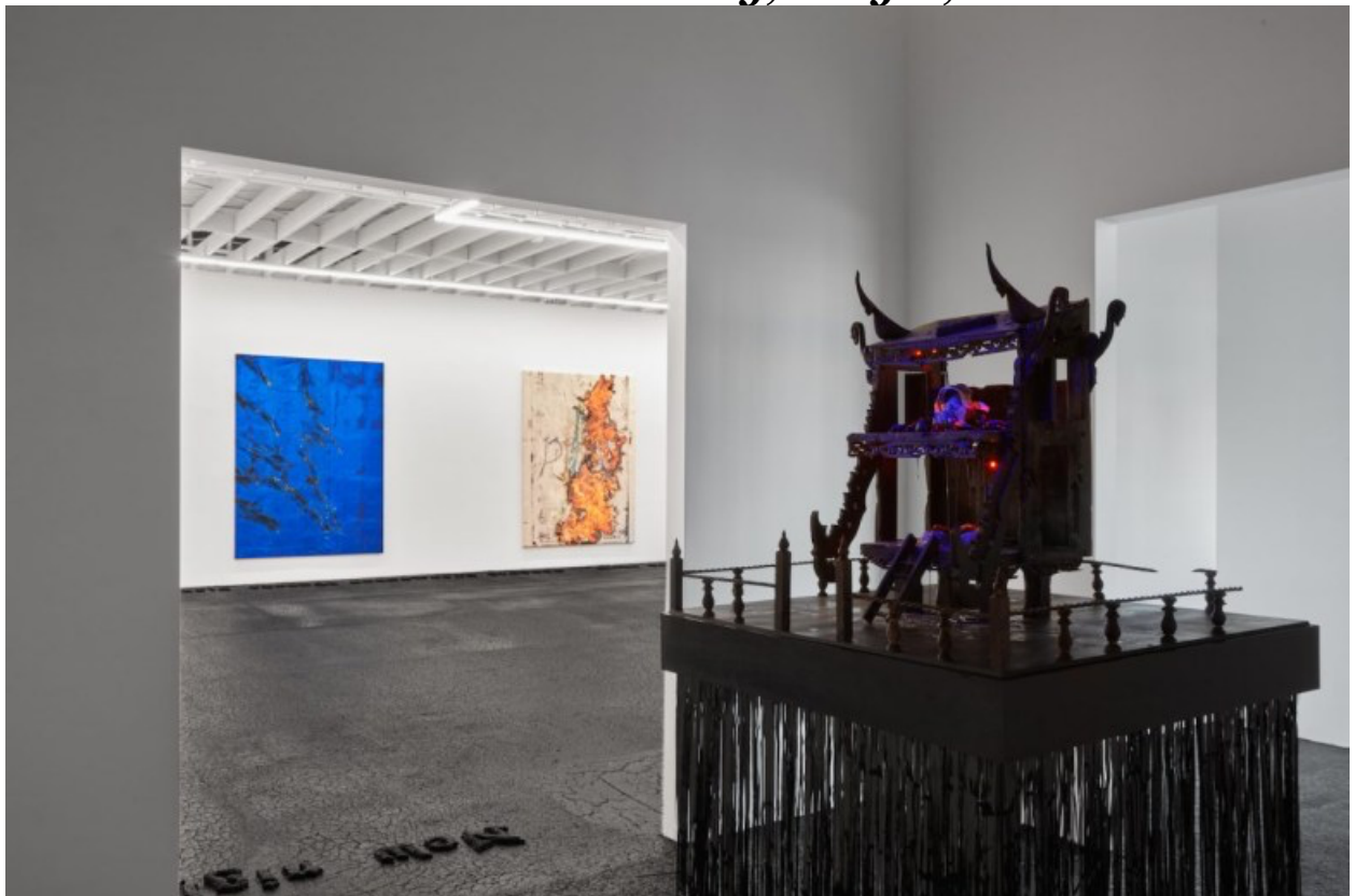
Installation view of Korakrit Arunanondchai: Painting, Prayer, Text

Korakrit Arunanondchai: Painting, Prayer, Text