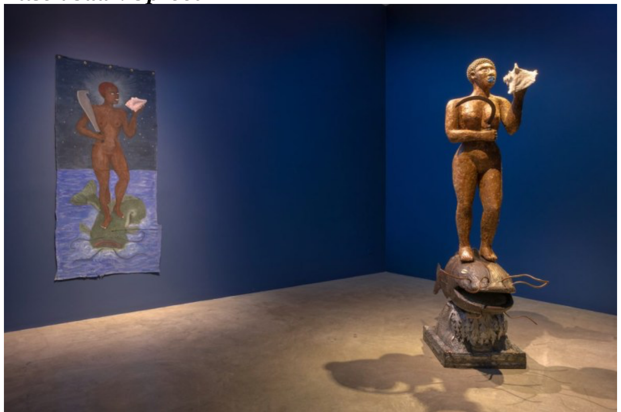
Installation view of Alison Saar: Uproot, 2023 (© Alison Saar; image courtesy LA Louver )