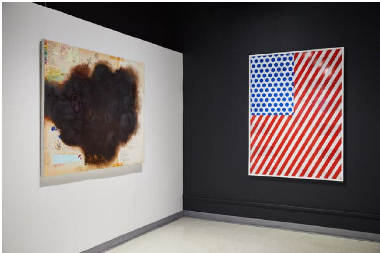
"Sketchbook, With Foreboding" (2019), left, by Renée Stout, and "Heavy Packed with Gas Mask (Amérique)" (2022), by Hank Willis Thomas, at the African American