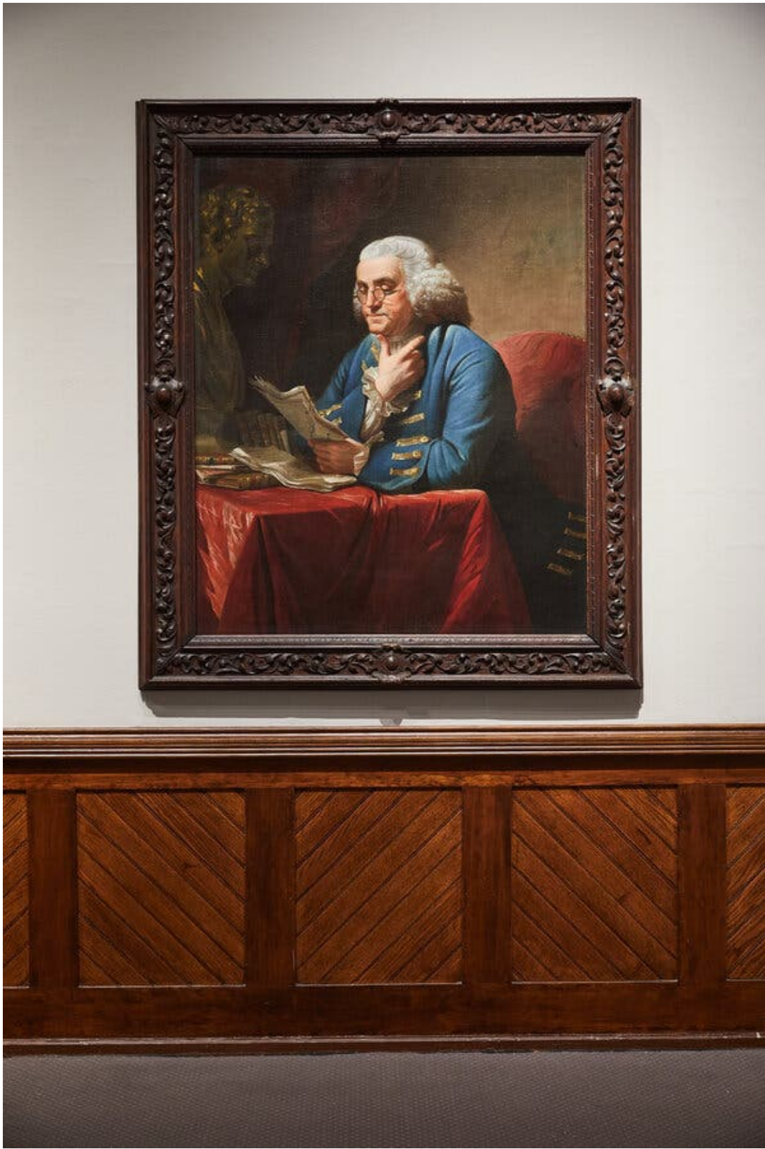
“Benjamin Franklin” (1767), by David Martin, from the permanent collection of the Pennsylvania Academy of the Fine Arts.