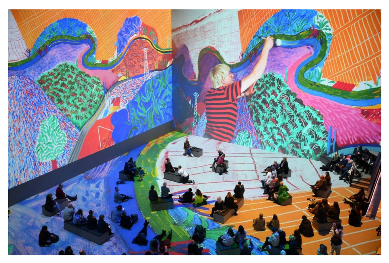
Visitors explore the show at Lightroom, a new venue in London.

A pivot into the immersive space is a natural progression for Hockney, an artist who has long exhibited a <u>fascination with technology</u>.