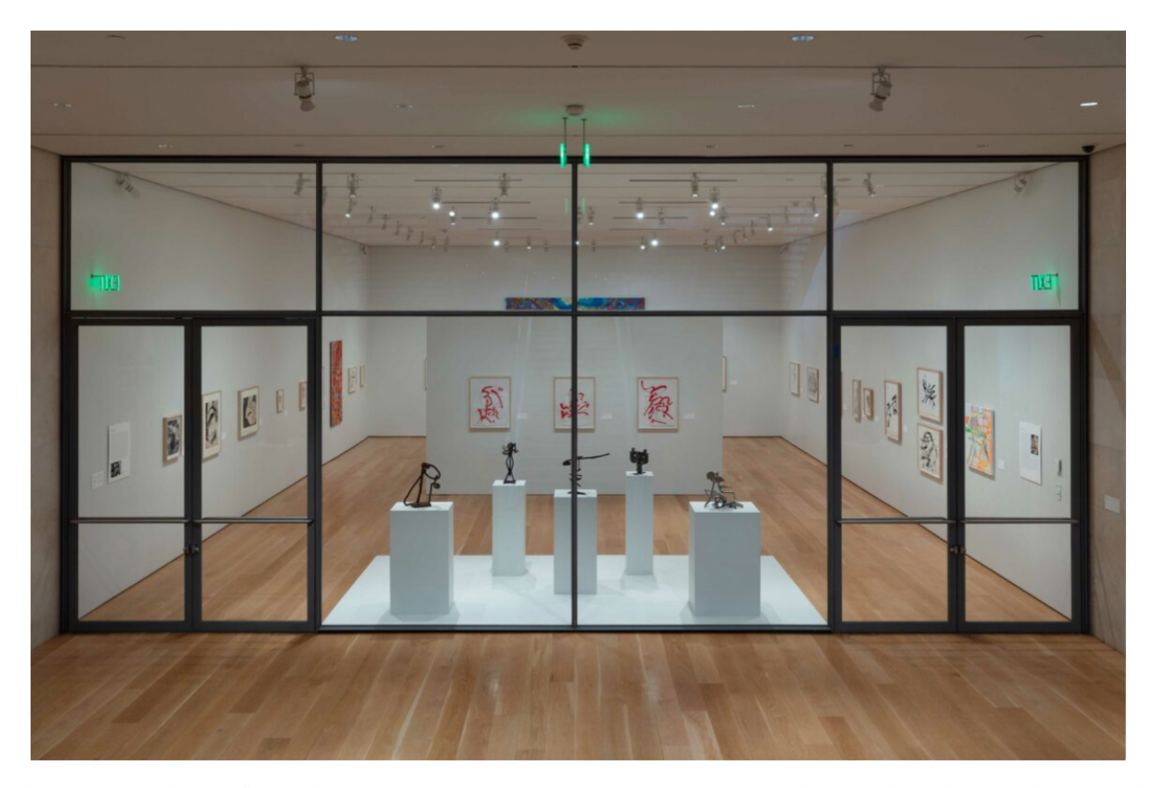
Installation view, "Mark di Suvero: Steel Like Paper," Nasher Sculpture Center, Dallas, January 28 – August 27, 2023. Art © Mark di Suvero

into each other, making a patchwork of color and combining lines with organic strokes. Already experiencing more than one image at once, the viewer could see yet another with a blacklight.