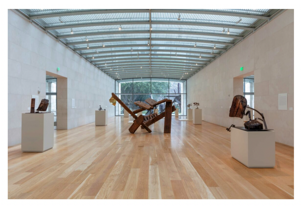
Installation view, "Mark di Suvero: Steel Like Paper," Nasher Sculpture Center, Dallas, January 28 – August 27, 2023.

Mark di Suvero: Steel Like Paper is an exhibition at the Nasher Sculpture Center in Dallas featuring work from the monumental sculptor's more than sixty-year career. Remaining tethered to poetic themes of humanity are 30 sculptures and over 40 drawings and paintings. Color erupts in his images, which constantly change with perspective. The largest exhibition of di Suvero's work since his solo show at the Whitney Museum of American Art in 1975, here his