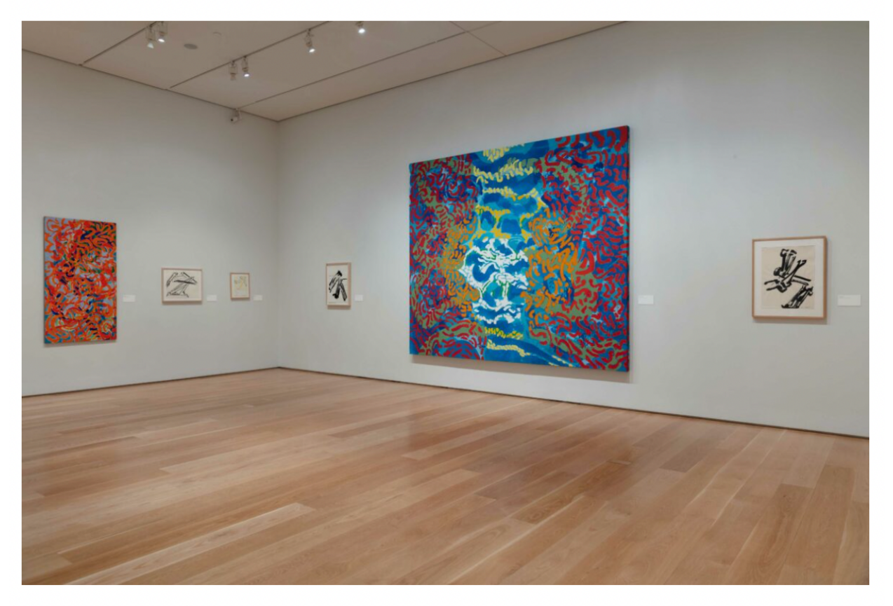
Installation view, "Mark di Suvero: Steel Like Paper," Nasher Sculpture Center, Dallas, January 28 – August 27, 2023. Art © Mark di Suvero

works from 2015, all untitled, he sprawls red acrylic and a stressed black sharpie from the center of the page. The red strokes recall the liveliness of his monumental sculptures, while the marker emulates their physical outlines. He says he uses color as emotion, for "its directness."