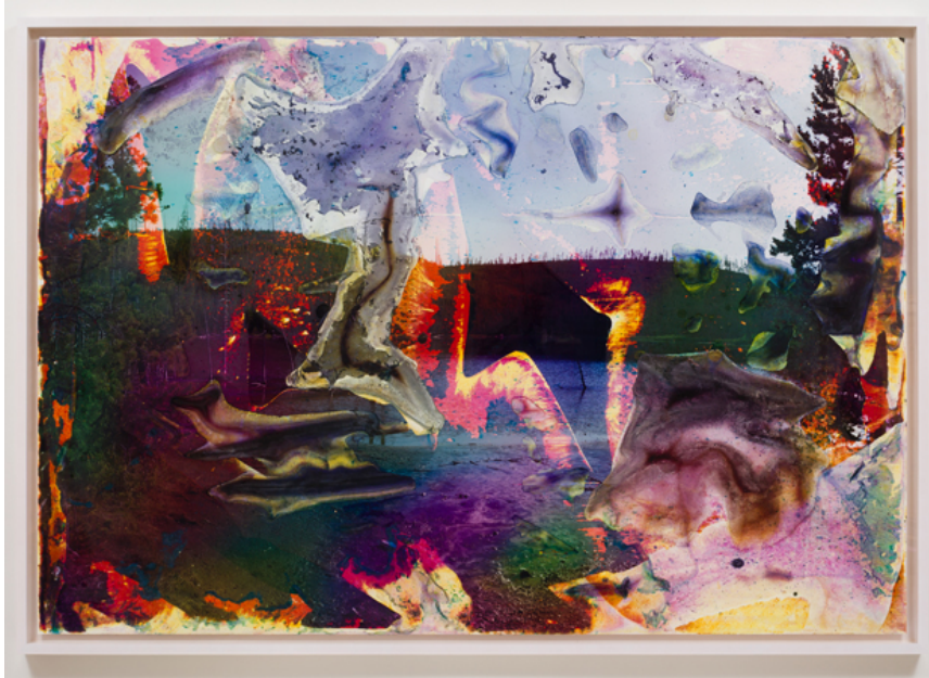
MATTHEW BRANDT RAINBOW LAKE WY 1, 2013 C-PRINT SOAKED IN RAINBOW LAKE WATER 72 X 105 IN. (182.9 X 266.7 CM) FRAMED: 76 3/8 X 109 1/2 IN. (194 X 278.1 CM) COPYRIGHT MATTHEW BRANDT, COURTESY L.A. LOUVER

Photographer Matthew Brandt pushes the chemical processes of the darkroom and commercial printing to dramatic effect by incorporating water sourced directly from his landscape subjects.