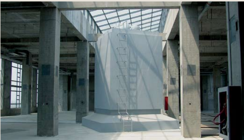
Sui Jianguo, Study of Base Plinth , wood and fibreglass, 600 x 450 x 450 cm. Courtesy of the artist.

art. Today many of these ugly edifices are already starting to be removed, but replacements continue to pour in. It is amazing how new public monuments can be so hideous; when Socialist statues suddenly appeared en masse in the 1950s, it must have also been a shock to the prevailing sensibility. But social realism at least had a coherent aesthetic, a consistent rhetoric. The new type of state-initiated capitalism has no ideological premise. It is “experimental,” for lack of a better description; Deng called the change in government’s economic policy “crossing the river stone by stone,” and the unprincipled “experimental” spirit is reflected in the artistic chaos erected in its glory. But the enthusiasm for monuments points to the spirit of a master narrative at work—exactly the continuation of the previous heroic project of modernity, and similarly uncritical of its debts to past history. In 1999 Sui Jianguo returned to the theme of the monument and cited mass commercial objects in his art. He chose the toy dinosaur with the embossed legend “Made In China” as the icon of the era ( Made in China , 1999) and reproduced faithfully the once-ubiquitous fibreglass panda bear trash bin.