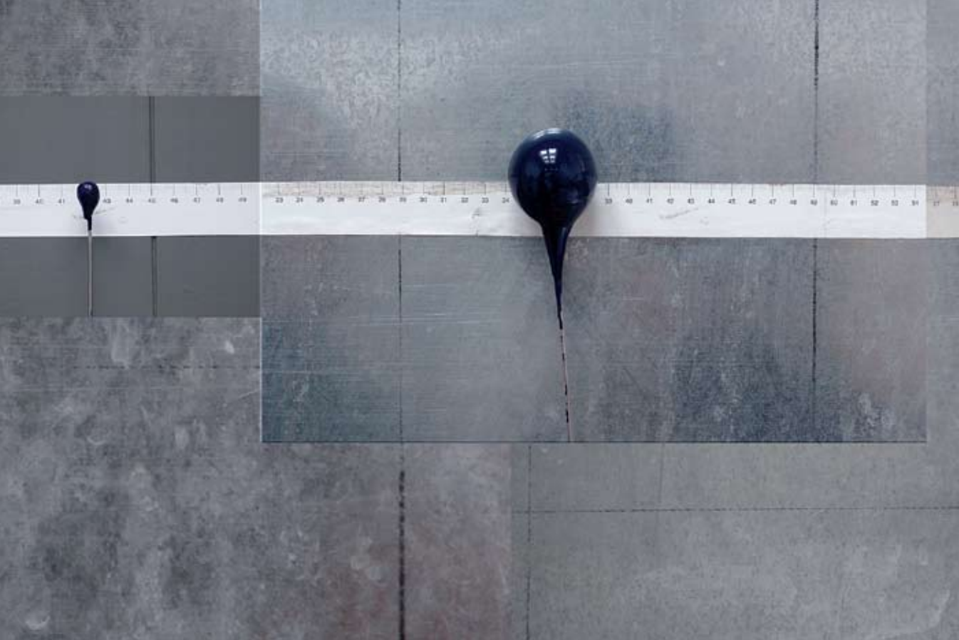
Sui Jianguo, Shape of Time, 2006 until the artist's death, paint.