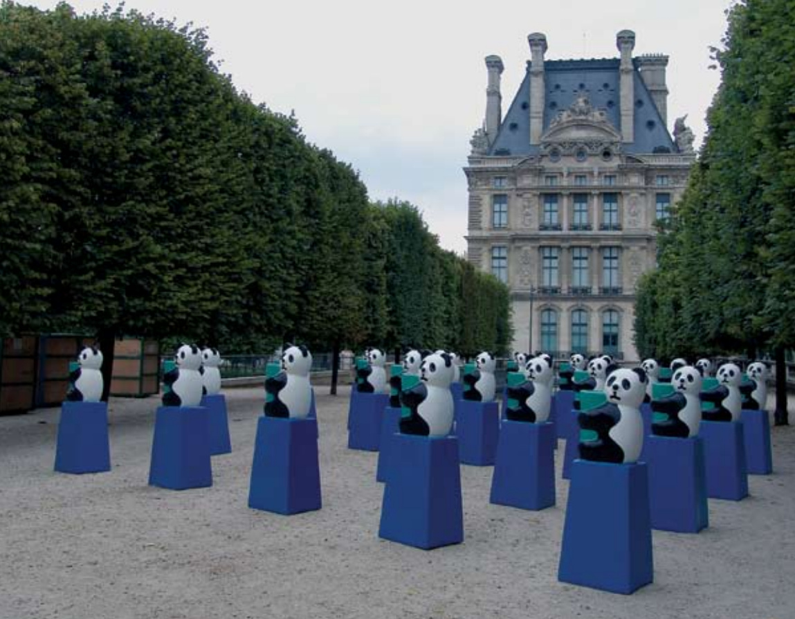
Sui Jianguo, Wasted Beauty , 2003, painted fibreglass, 150 cm each.

landscape of Guilin, represents the new relationship to timeless nature. Bringing together the image of the Zhongshan jacket and classical Western art in a new work, in 2004 the artist made a series of six life-sized portraits in parody of the famous classical Greek statue Discobulus by Myron. The six portraits are of five renowned Beijing property developers plus the artist himself, and they are destined for display in a new urban development project. This is the new public monument of the modern Chinese, idealized in a colonized physical beauty, half a century after the Revolution.