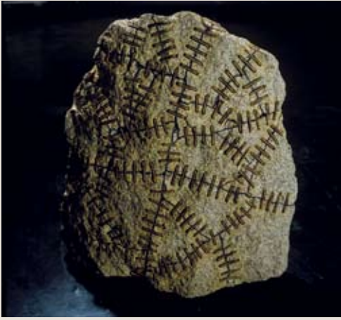
Sui Jianguo, Structure Series , 1991, granite and steel, 83 x 60 x 40 cm.