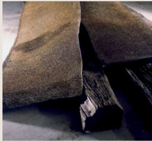
Sui Jianguo, Execution , 1996, rubber and iron nails, 150 x 500 x 40 cm.

subtle withdrawal of the chest. This new jacket, essentially Western, is made with lifted shoulders and a thrusting stance expected of the soldier: it is designed for standing to attention rather than for carefree movement of the limbs. After Mao's revolution it is impossible not to associate this jacket with the Communist leader, or with the form of Communism and ideological institution that carry forward the legacy of reform. Sui Jianguo's sculptural icon monumentalises the symbolic jacket, showing its staying power even as it is left without a carnal human occupant. The "Father of the Nation's" legacy has been passed on to the "Great Leader," finally to become the outfit of the absent father who is yet ubiquitous and cannot be removed.