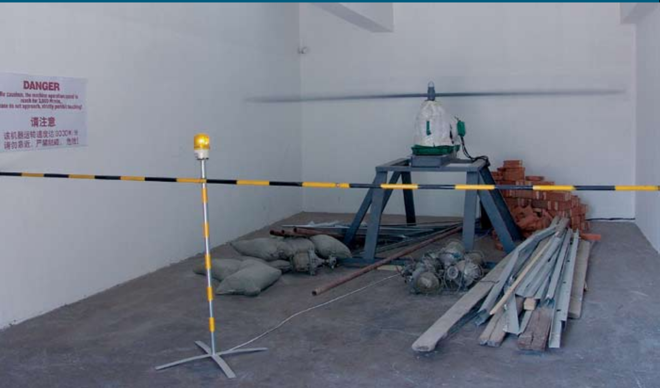
Sui Jianguo, Speeding Up—140 kph , 2007, installation. Courtesy of the artist.

Sculptor Sui Jianguo's latest exhibition, held in March 2007 in Beijing, presents a video installation titled Speeding Up . A large set of spinning mechanical arms charging around an axis at breakneck speed—140 km an hour, to be exact—forces the audience towards the walls of the exhibition hall where twelve equally spaced videos show synchronized documentary films of a train passing by at regular intervals. The exhilaration of speed as the arms spin around in a circle, essentially going nowhere, shocks the visitor and injects a feeling of adrenalin in the hall. The film was shot at a village near Beijing where test runs for Chinese trains are made in a very large circular loop, which completely encircles the village. When a test run is on, twelve gates crossing the tracks to the village are synchronized to shut and open at regular intervals to allow traffic through. Speed driven by mechanical power, an iconic symbol of the industrial age, is represented in this installation as a blind power lost in its own might. As a laboratory experiment, the only purpose speed serves is to measure time. But Sui Jianguo reminds us that speed is more than a measuring rod; it actively enforces a regularity of time by delivering the train at appointed intervals at the evenly distributed gates.