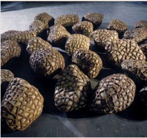
Sui Jianguo, Earthly Force , 1992-94, stone and welded steel, 60 x 70 x 50 cm.