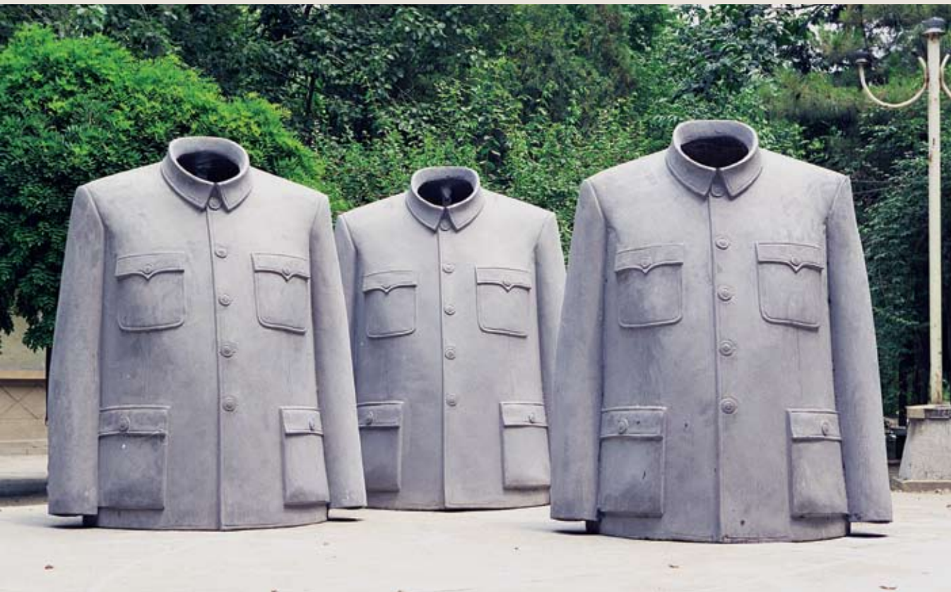
Sui Jianguo, Legacy Mantle , 1997, painted fibreglass, 320 cm.

By going to the root of the premise of Social Realism via the human body, Sui Jianguo exposes the myth of Chinese modernity. As a reference for the imagination, the artistic monument gives shape to ideology and becomes the object of desire, the physical shape of a perfect future and the symbol of authority. While the revolutionary monument gives substance to a concept, Sui Jianguo finds that even as the monument is dismantled it continues to haunt us and continues to constitute the source of meaning for China. In 2003 and 2004 he made several works that refer directly to monuments of Mao Zedong. Study of Base Plinth is simply a six-metre-tall plinth with an iron-runged ladder on the side; it is the kind of plinth large public statues stand on, but there is no statue here. As the viewer climbs to the top there lay the remains of a pair of shoes, made to look as though a previous marble statue has been rudely removed. Another work, titled Study of Clothes' Veins: Right Arm , is simply the stretched arm broken off from a very large statue (of a size suitable for the Study of Base Plinth ), an arm from the statue of a leader waving to the crowds that is familiar to every Chinese. This is of course a satire of the material contingency of the monument, but it also points to the absence that continues to operate and support the ethos of modern China: the hollow that sucks everyone forward to seek fulfilment in order to fill the void left by the fallen monument.