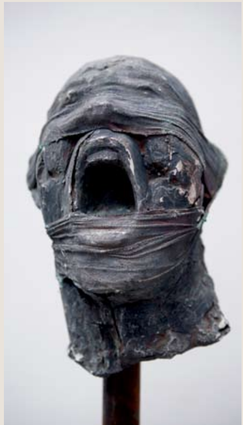
Sui Jianguo, Untitled Bust With Plastered Bandages , plaster of Paris, 40 x 25 x 25 cm.