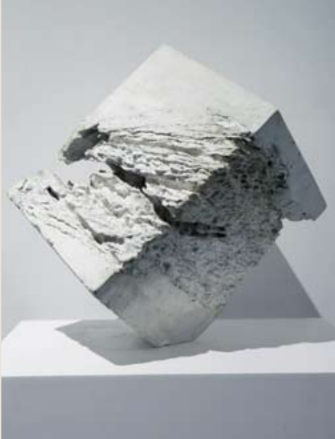
Sui Jianguo, Untitled , 1987, plaster of Paris, 40 x 30 x 30 cm.

square cube of plaster with one corner eroded by a constant stream of flowing water ( Untitled , 1986). He also began to look below the surface of the sculptured form to seek the inner core of the figure, by literally opening up the “shell” of sculpted busts ( Unborn Bust Portraits , 1988–89) or making broad cuts into raw blocks ( Bust Portraits , 1989). In the face of the student movement and the siege of Tian’anmen Square in the summer of 1989, Sui began to infuse his figurative works with a tragic heroic strength, and the Untitled bust with plastered bandages (1989) was made before he went on one protest march not knowing if he would return safely. These works are powerful not just because of their expressiveness; they are powerful perhaps also because they bring forth an underlying concern with destiny that has always haunted the artist. Through a radical act of rebellion the artist both acknowledges the power of the status quo and claims his own position within the structure of its evolving ideology.