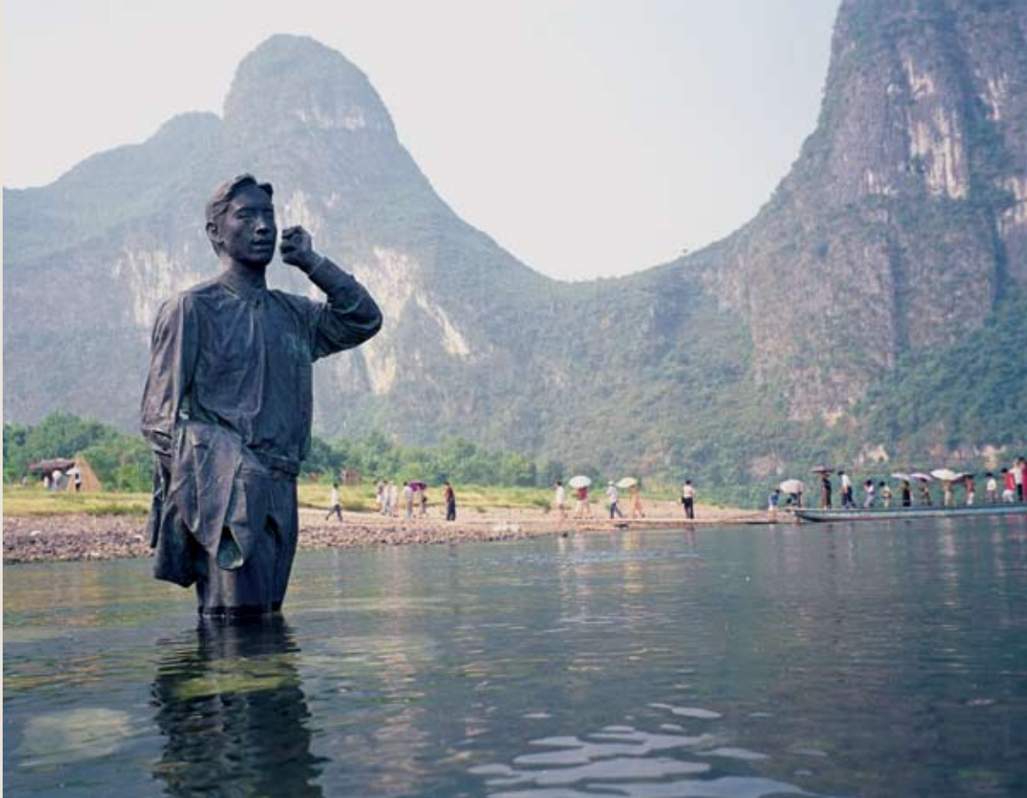
Sui Jianguo, Man Crossing River , 2000, bronze.

into artwork an essential mystery that escapes the monument, which is attention to the finite and the living moment.