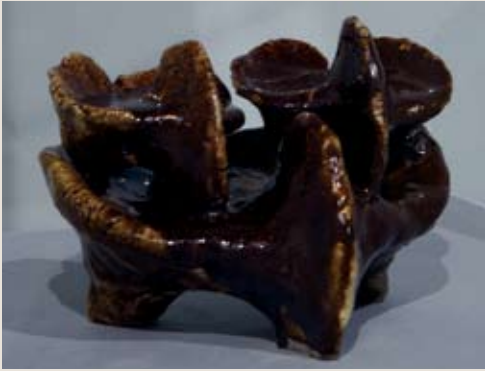
Sui Jianguo, Three-Legged Bird , 1985, ceramic, 20 cm.