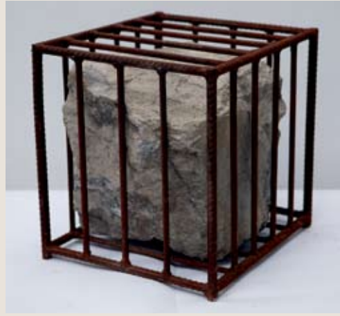
Sui Jianguo, Untitled , 1990, stone and iron, 40 x 40 x 40 cm.