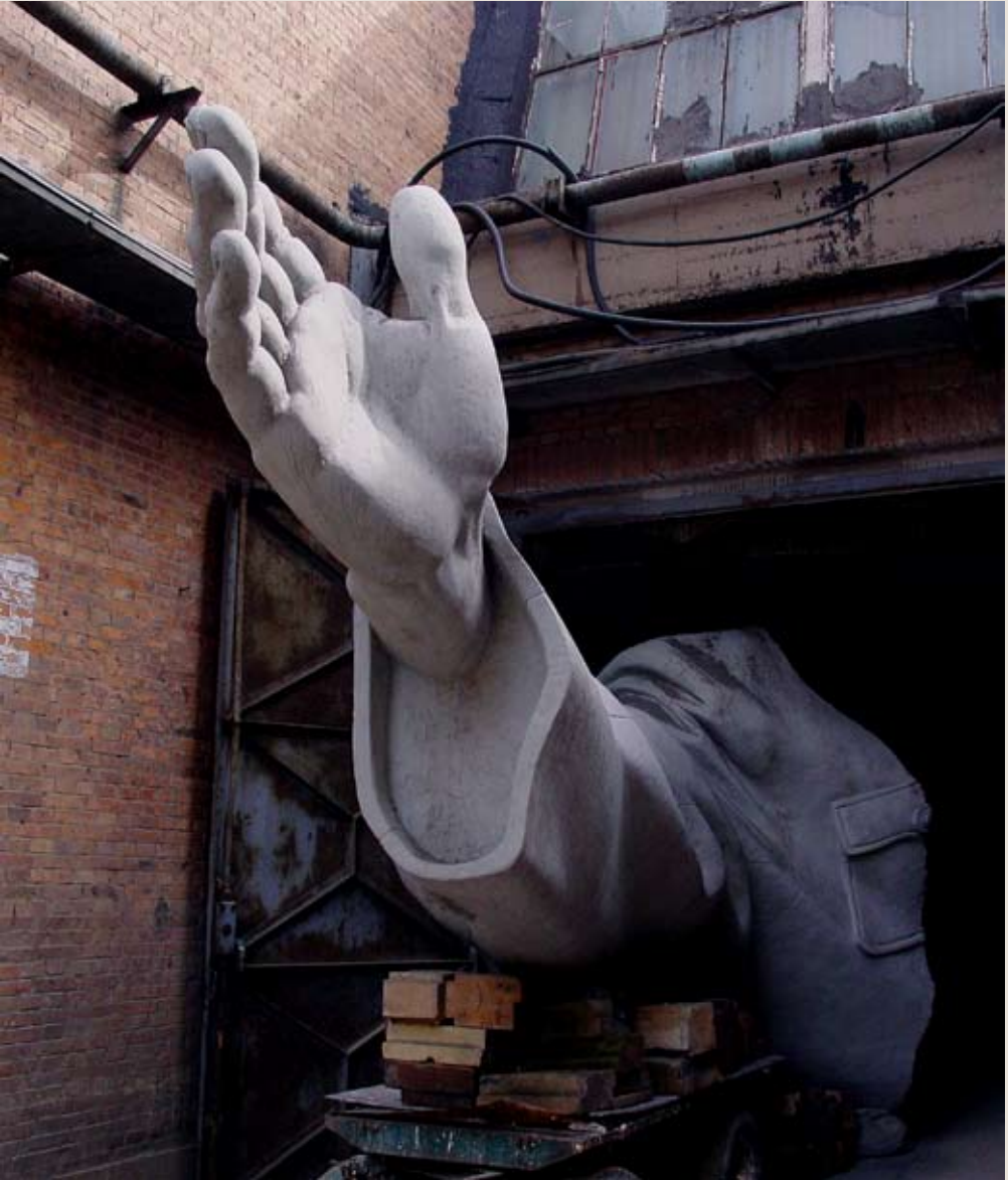
Sui Jianguo, Study of Clothes' Veins—Right Arm , 2003, fibreglass and resin, 700 x 230 x 250 cm.

expression and original forms, Sui Jianguo makes it clear that he has lost faith in the idea of the original genius of art, and he positions himself as artist as the provider of context and as interpreter through citation. The monument is no longer the visualisation of an ideal, nor does it glorify the hero beyond this mortal life. Sui Jianguo has made these sculptures in the context of China's public monuments to draw our attention to the mundane and to confront the absurdity of the present cultural demise of China. Without people taking notice of the change, Sui Jianguo shows that the national Chinese dragon has quietly undergone a transformation into the dinosaur-dragon, prompted by exports to the Western toy market. Likewise the panda bear, happily exploited as the mascot of good will, is unthinkingly used to contain rubbish in public places ( Wasted Beauty , 2003). He shows us how the great vision of modernity is actually realised in the daily context of China here and now.