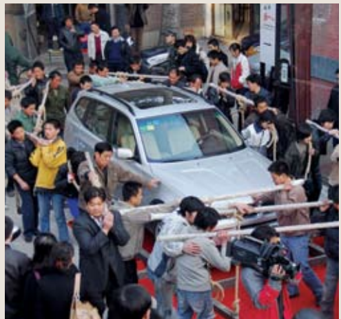
Sui Jianguo, Horizontal Movement—50 Metres , 2006, performance.

Sui Jianguo now says he is increasingly drawn to themes dealing with time. Having spent all these decades with sculptural monuments, he appears thoroughly disillusioned by the hollowness of the grand gesture. His own projects clearly repudiate claims to historical destiny; in reverting to the uncertainty of the working process, the artist gives priority to the contingency of the moment. It is the meaning of “living,” not the meaning of “life,” that confronts a person every day; it is by the continuous effort of taking stock of time past, reordering and rediscovering memory, that life is made meaningful. As a sculptor who has arrived at the pinnacle of the official art establishment,