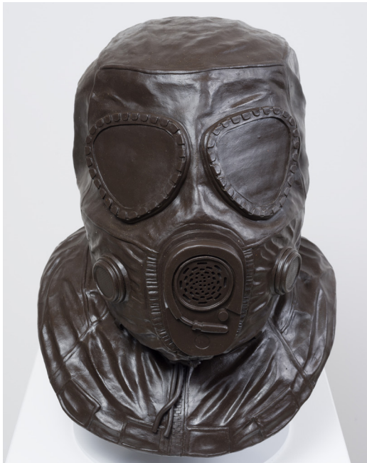
Gas Mask, 2016 stoneware, beeswax, 20 x 15 x 19 in. (50.8 x 38.1 x 48.3 cm)