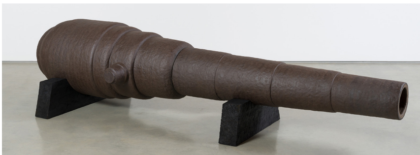
100 TON GUN, 2016 stoneware, 130 x 32 x 25 in. (330.2 x 81.3 x 63.5 cm)

The exhibition title, Reign of Fire , is a nod to the making of the works, many of which are ceramics fired in a kiln. Moreover, it speaks to the overall subject matter – the power of humanity to exact war, to dominate and to repress. This is most evident in a series of cannons, which Jackel created from stoneware in a range of sizes (the largest being 100 Ton Gun [2017], which measures over 10 ft./300 cm in length). Resting on the floor in dense parallel formation, each is reclined and pointed forward as if ready to be engaged. They serve as a gruesome reminder of our war history and the countless lives claimed. “We live in a nation that has been at continuous war for 16 years,” Jackel states. “These ceramic sculptures of actual old cannons represent the memory of our battlefields and the realization that, day by day, we are living through the longest war in American history.”