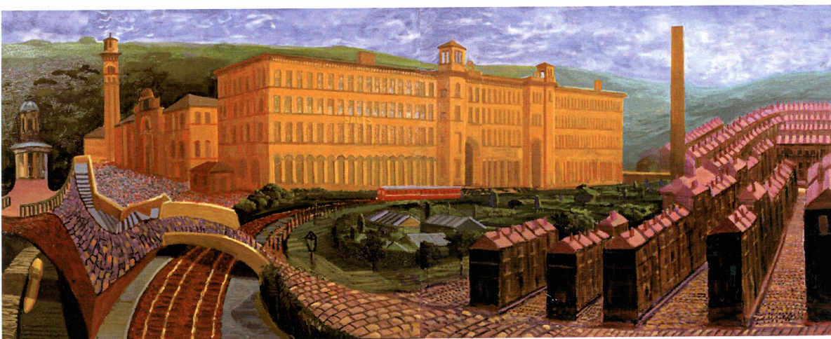
Salts Mill, Saltaire Yorks, 1997 Oil on two canvases, 48 x 120 in.