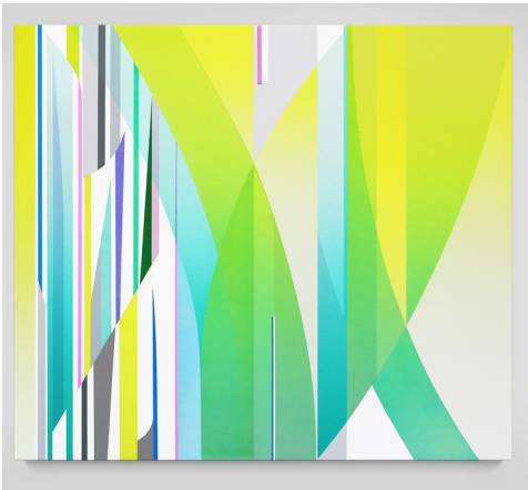
Aglow , 2023 acrylic on canvas 21 x 24 in. (53.3 x 61 cm)

Where works like Red Rhythm and Dawn Chorus concentrate on an experiential feeling, others are more narrative. ForceField (2023) presents an energetic science fiction scene of magnetic movement interposed with gravitational drops of purple, a shape only recently developed by Johnson. Diver (2023) evokes a more intimate story of diving into the ocean and the sensations of warm and cold currents through different values of blue.