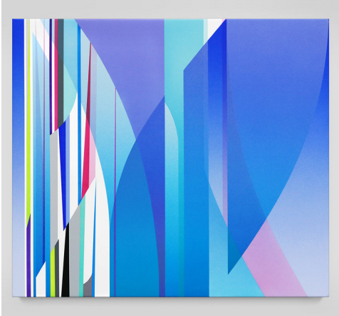
Diver , 2023 acrylic on canvas 21 x 24 in. (53.3 x 61 cm)