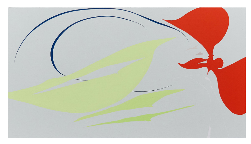
Gazer, 2020, oil on linen 30 x 54 ¾ in. (76.2 x 139.1 cm)

Other works seem pregnant with color, full and brimming with pure pigment. Glider 's rotund blue edges onto a surface of rich berry red, alive with organic abstractions in pinks and greens. Prolonged viewing reveals subtle variations of color and detail.