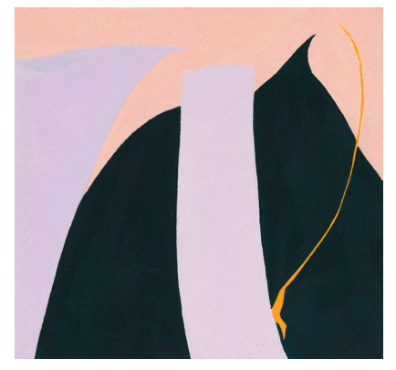
Scape, 2020, gouache on paper 3 3/4 x 4 in. (9.5 x 10.2 cm)

Concurrently on view at L.A. Louver (24 May – 2 July 2021): FIRST FLOOR GALLERY Rebecca Campbell: Infinite Density, Infinite Light