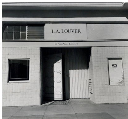
L.A. Louver's historic façade at 55 North Venice Boulevard, 1975-1976