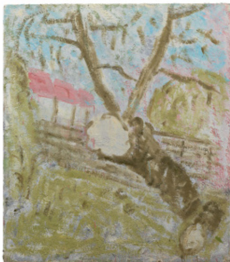
Cherry Tree in Spring , 2015 oil on board, 56 x 48 in (142.2 x 121.9 cm)