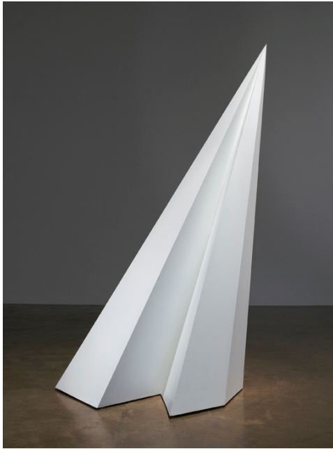
Sol LeWitt, Pyramid #10 , 1985, wood painted white, 79 7/8 x 47 x 37 1/2 in. (202.9 x 119.4 x 95.3 cm) © 2011 The LeWitt Estate / Artists Rights Society (ARS), New York

Three large-scale works on paper (two in excess of 5 x 7 feet), 2003-2005, accompany the structures. Executed in gouache (which the artist first used in 1981), the water-based medium allowed LeWitt to overlay different colored washes to achieve a wide variety of colors and tones. Comparing the gouaches to his wall drawings, LeWitt stated that only he could make the gouaches, which “followed their own logic,” whereas the wall drawings “have ideas that can be transmitted to others to realize.”