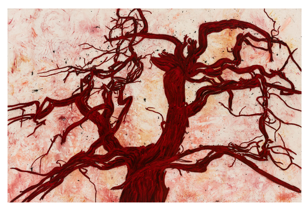
Tony Bevan, Untitled (The Trees, Number 4) , 2012 pigment and acrylic on canvas, 68 1/4 x 93 1/2 in. (173.4 x 237.5 cm)

paper, working first on the floor and then on the wall. Grainy residue and clumps of medium are dispersed throughout the works, which give them a visceral appearance, and demonstrate the intense physicality of their creation, while conveying complex and ambiguous emotional content.