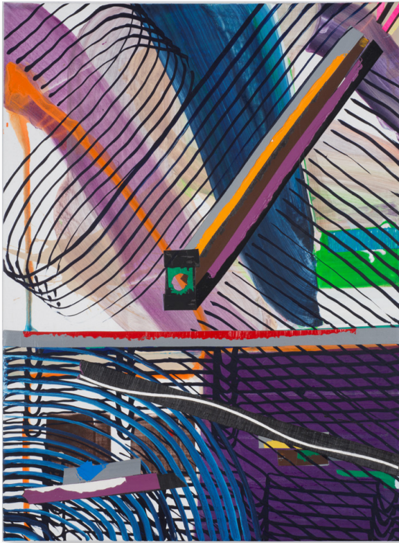
Sombra y Viajero 2013 vinyl, acrylic, dispersion and dry pigment on canvas 24 x 18 in. (61 x 46 cm)